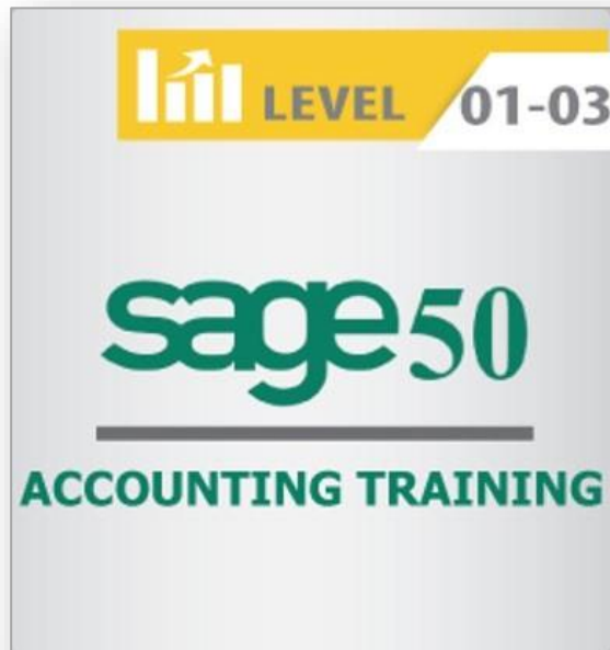
Sage 50 Accounts Training Level 1 – Level 3