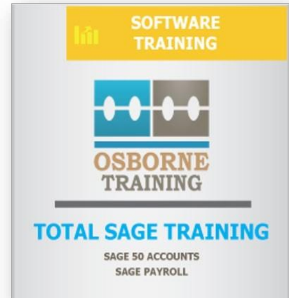
Sage 50 Payroll + Sage 50 Accounts Training Level 1 – Level 3

GOT ANY QUESTIONS? Call an Advisor now on: 0203 608 7179