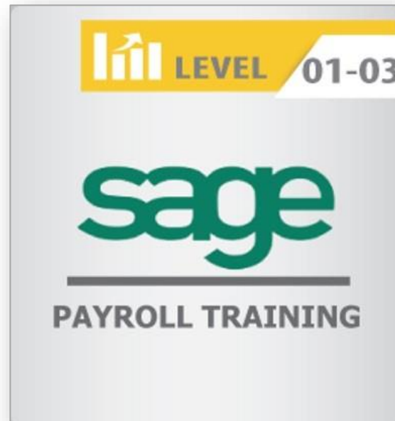
Sage 50 Payroll Training Level 1 – Level 3